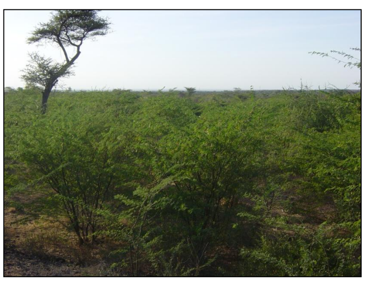
Prosopis juliflora infestation in northern Ethiopia.

zones and regions, respectively). In 1979, thousands of P. juliflora seedlings were brought from a nursery in Hirna, Harerge, and were planted in all Assebeteferi Awraja including Amibera, Gewane, Afdem and East Awash (now known as species However, Awash). the became invasive in the early 1990s, coincidence with the new in Transitional Government in Ethiopia that is also referred to by political opposition groups as Woyane. It took only 20 years for the species to naturalize, produce selfa perpetuating community and become an independent invader. In Afar region, the tree is now known as