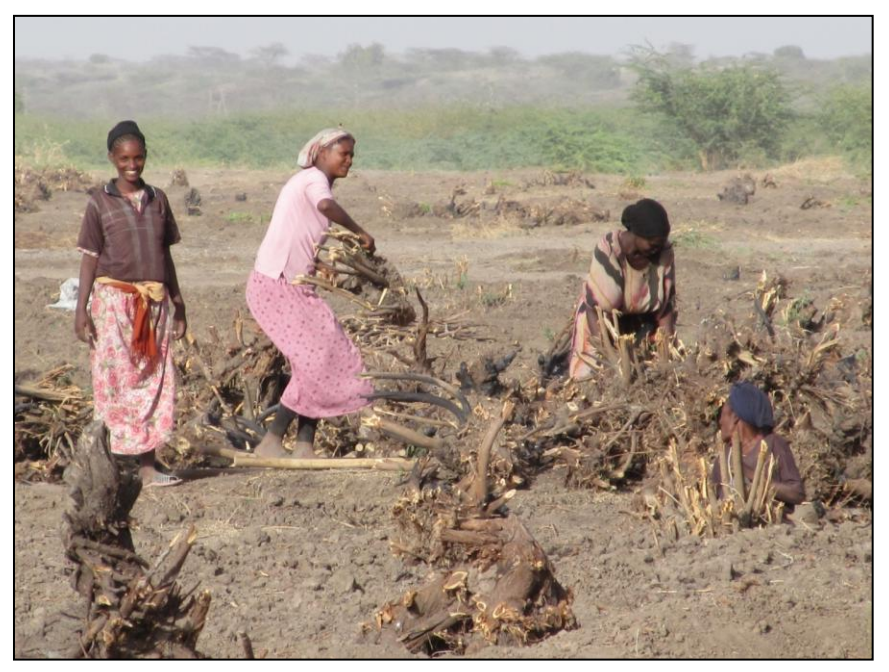
Women removing uprooted P. juliflora stumps from invaded lands in the Afar Region, Ethiopia.

According to FAO a estimate, in 2010, Ethiopia produced 3.7 million tones of charcoal and exported 84 tons to other countries (FAOSTAT, 2011). It should be noted, however, that unsustainable harvesting can lead to deforestation. In Ethiopia, cutting indigenous trees for fuel wood purposes has resulted in loss of natural forests and land degradation (Haile et al., 2010; Mekonnen, 2009). In the Afar Region, indigenous trees are still harvested for energy purposes, but the availability of P. juliflora has relatively reduced the harvesting pressure on local trees.